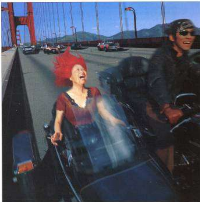
Miwa Yanagi, Yuka , chromogenic print (approx 5ft sq), 2000, Seattle Art Museum collections

STUDENTS WITH DISABILITIES: If you require accommodation based on a documented physical or learning disability and/or have emergency medical information to share; please contact me or make an appointment with me as soon as possible. If you would like to inquire about becoming a Documented Disabled Assistance student you may call 1-425-564-2498 or contact Susan Gjolmesli at sgjolmes@bellevuecollege.edu or on campus, go in person to the DRC (Disability Resource Center) reception area in B132.