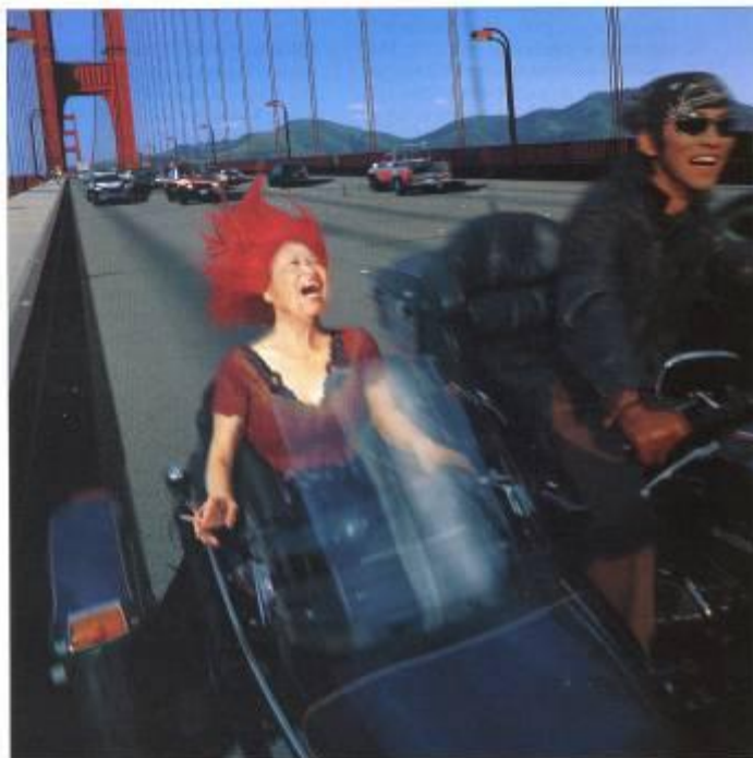
Miwa Yanagi, Yuka , chromogenic print (approx 5ft sq), 2000, Seattle Art Museum collections

STUDENTS WITH DISABILITIES: If you require accommodation based on a documented physical or learning disability and/or have emergency medical information to share; please contact me or make an appointment with me as soon as possible. If you would like to inquire about becoming a Documented Disabled Assistance student you may call 1-425-564-2498 or contact Susan Gjolmesli at sgjolmes@bellevuecollege.edu or on campus, go in person to the DRC (Disability Resource Center) reception area in B132. DRC has moved temporarily to the Library Media Center.