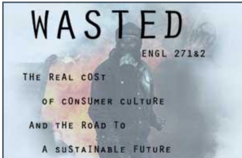
WTO protests, Nov. 1999, Seattle