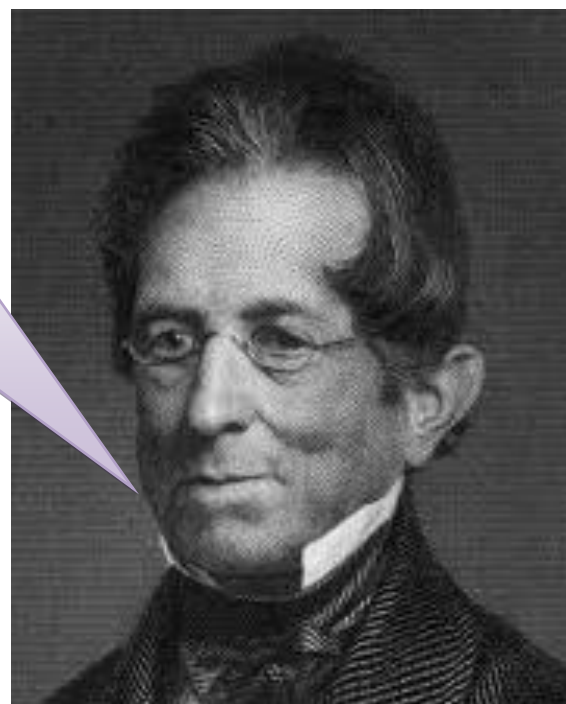
Thomas Hopkins Gallaudet

Class Website: It is YOUR RESPONSIBILITY to know what is available on Canvas. Class documents are frequently added as resources and class materials such as Homework, handouts, class bulletins, and discussions.