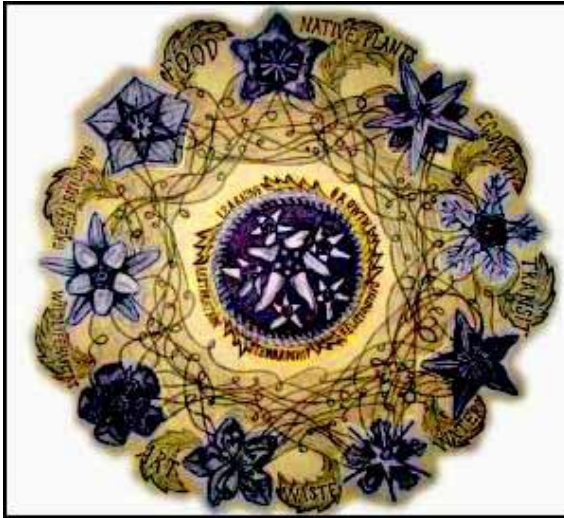
Wheel 350 "every citizen should be a sustainability steward"

What you will be able to show for all this: