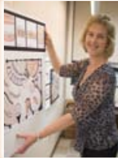
Professional & Technical Programs