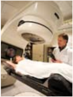
Bachelor of Science Degree