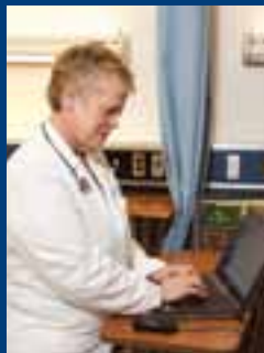
Professional & Technical Programs