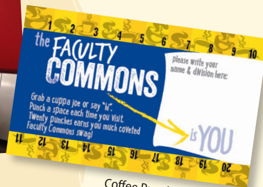
Coffee Punch Card Program