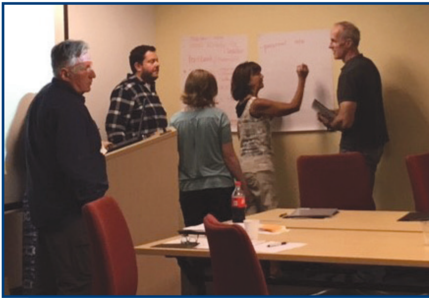
Fall 2017 Adjunct Faculty Orientation

This workshop will bring faculty together to build a community of hope around social injustice and ecological crises by bringing sustainability to our classrooms. The workshop will feature faculty-presentations from a broad range of disciplines, and will also include ample time for discussion and group work. Workshop presenters will address