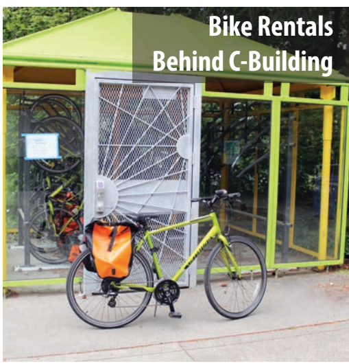
Bike Rentals Behind C-Building