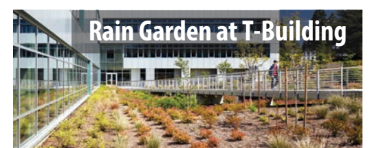
Rain Garden at T-Building

Recycling on campus is co-mingled, meaning that recyclables (paper, plastic, glass, and aluminum) can all go into the same bin and ultimately dumpster, making it more convenient and easy for everyone.