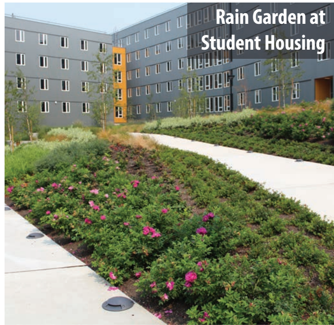
Rain Garden at Student Housing