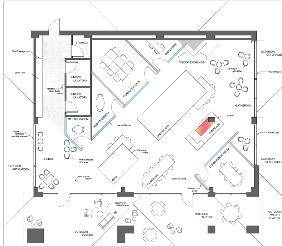
1 FLOOR PLAN SCALE: 1/4" = 1'-0"