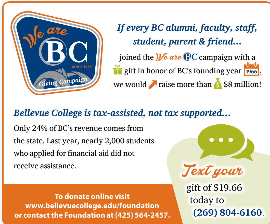
Bellevue Reporter Ad External Audience