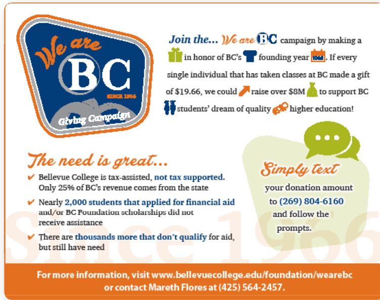
Exceptional Magazine Ad (Bellevue College Magazine) Internal Audience