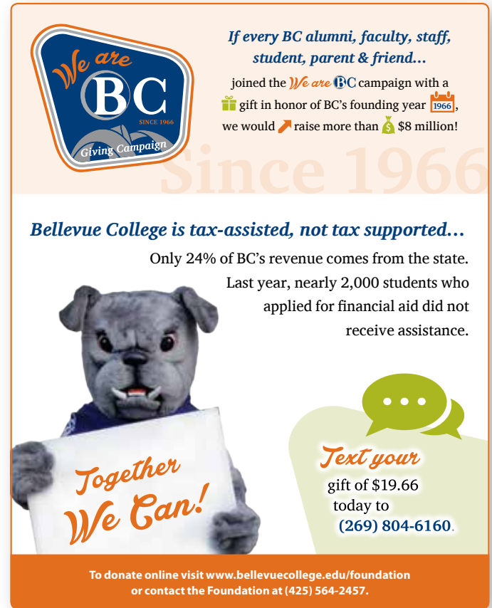
Watchdog Ad (Bellevue College Newspaper) Internal Audience