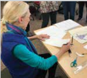
Art and Design

No matter what your interests are or your path in life, BCCE has the classes for you.