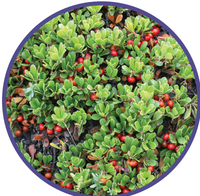
4 Erosion Control