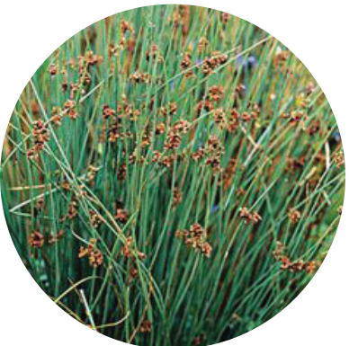
4 Planting - Juncus