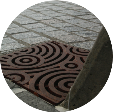
2 Runnel & Trench Grate