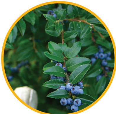
2 Edible Planting