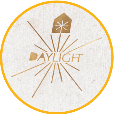
Integrated Signage in Site Details