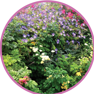
1 Pollinator Plants