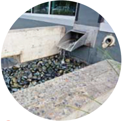
1 Architectural Stormwater Feature