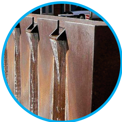
Architectural Stormwater Feature