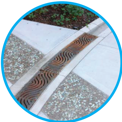
Runnel & Trench Grate