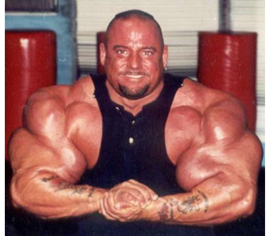
"The Man Whose Arms Exploded"