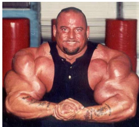
"The Man Whose Arms Exploded"