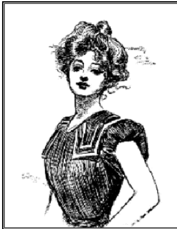
The Gibson Girl