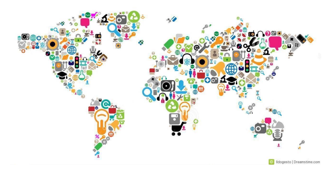
Introduction to Sociology (SOC 101) Fall 2017 5 Credits