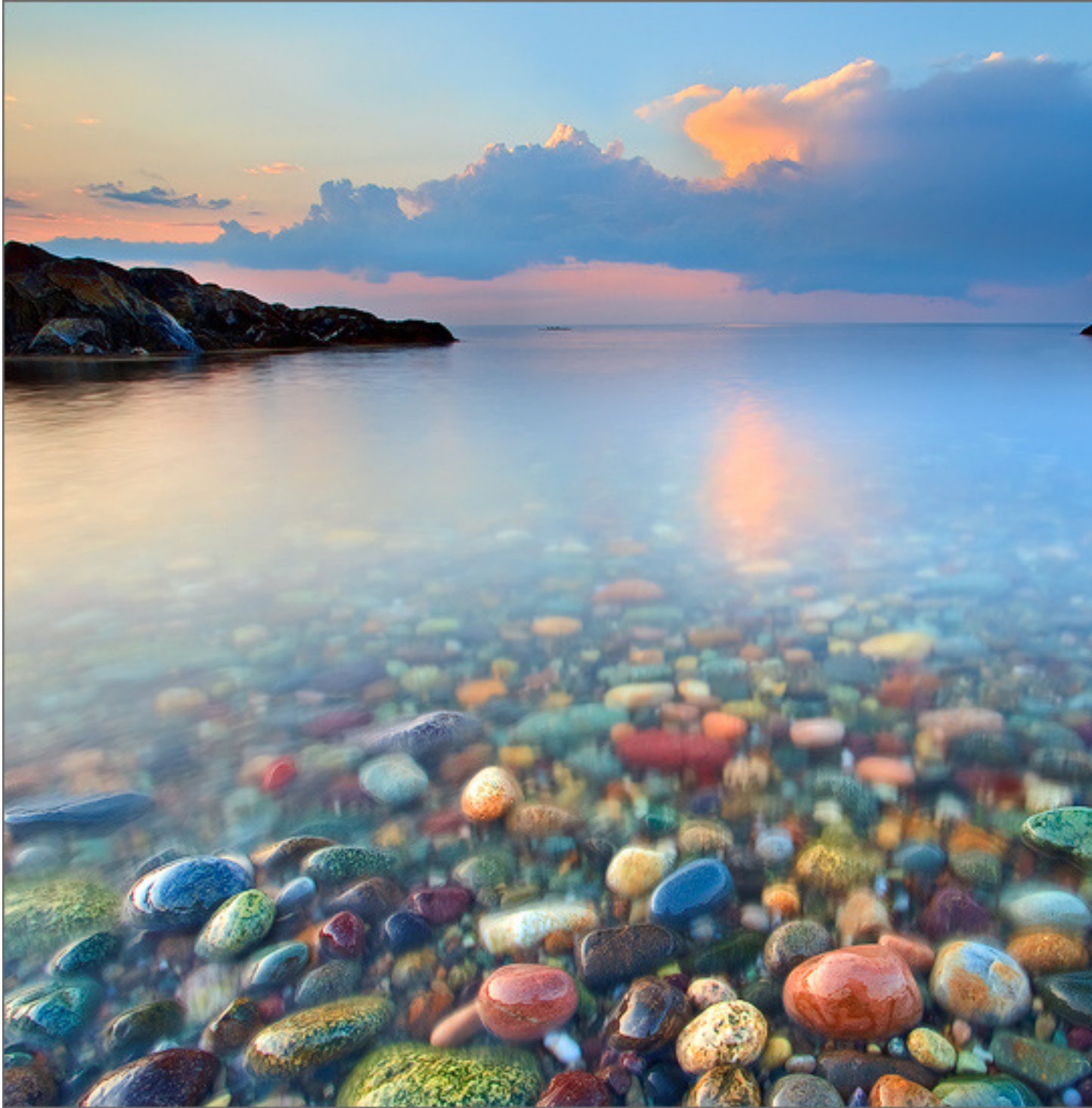
Rocks in Cohasset, Massachusetts, my hometown. Dad (age 92) still lives there!

Welcome to Geography 102. This is a five-credit course that fulfills a Social Science distribution requirement for the Associate