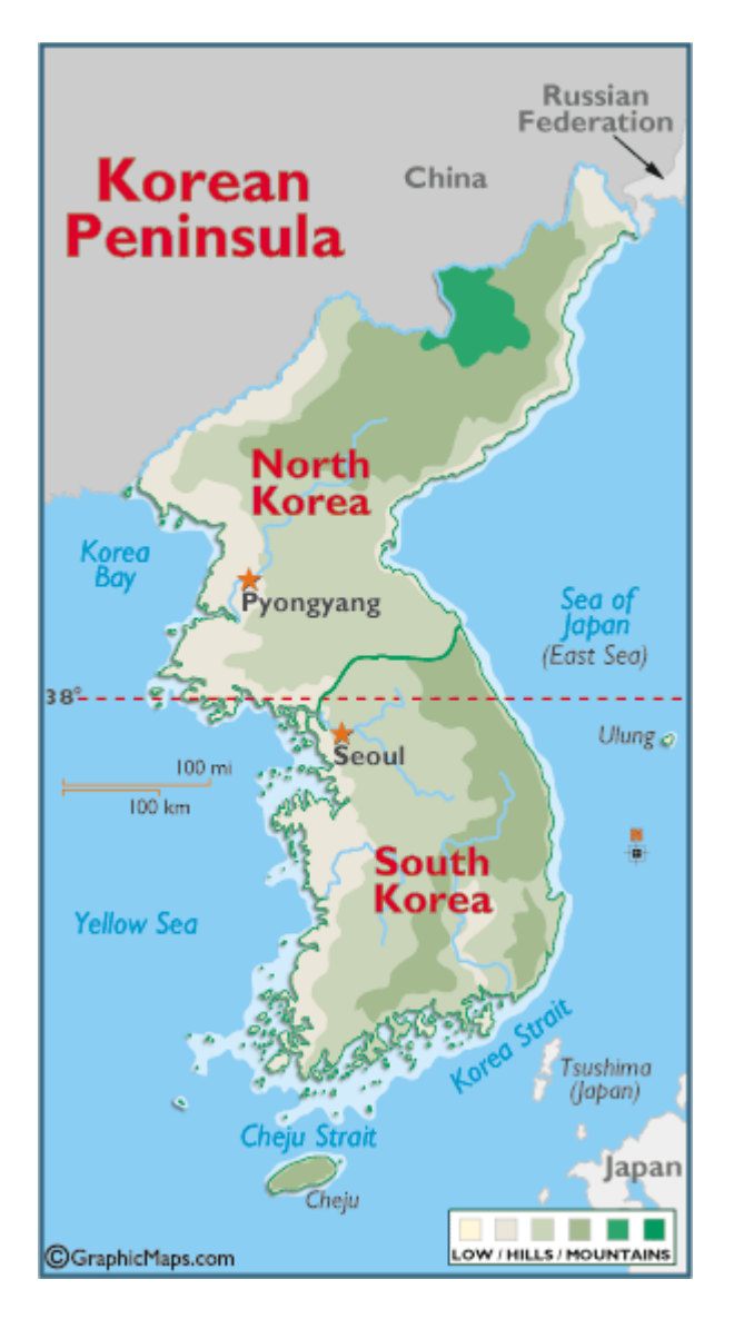
North Korea has higher mountains than South Korea, making agriculture difficult in the North. GraphicMaps.com