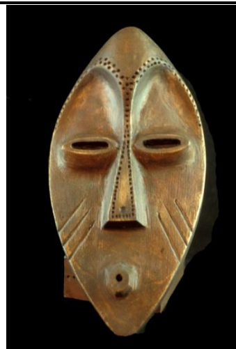
Student carved African masks: left: Kwele mask; right: Etoumbi Mask