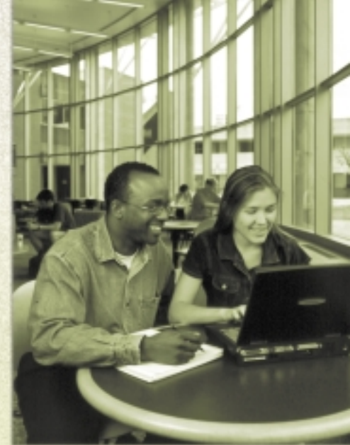
The BCC Student Union Building is one of many spots students gather on campus to work together.