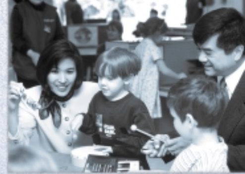
Governor Gary Locke and First Lady Mona Locke at the opening ceremony of the new Childcare Center last spring.

The Educator-to-Educator Institute (E2E) at the National Workforce Center for Emerging Technologies at BCC provides national training for information technology (IT) professionals and educators. E2E staff joined forces with Microsoft and the American Association of Community Colleges last spring to establish a Working Connections IT Faculty Development Institute. In the coming year, the new national system of Institutes will provide the most current IT technology training for instructors at community and technical colleges across the country.