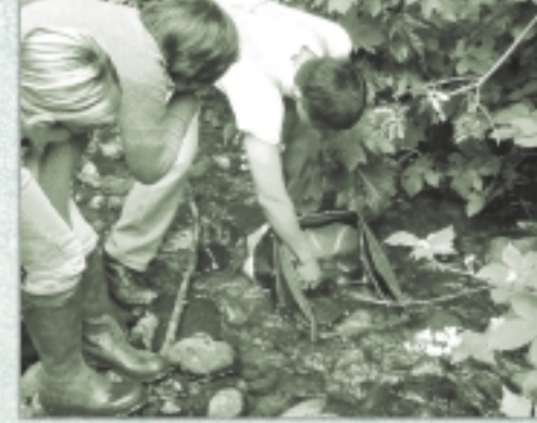
Science students measure water quality in a local creek for a service learning project.

In a continuing partnership with Stevenson Elementary School to encourage an interest in science among children, BCC science instructors shared their knowledge and passion for science with students at the Bellevue elementary school. The annual "Young Scientists Celebration" in May featured a school assembly, group projects and hands-on demonstrations.