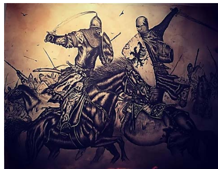
An example of my art.

With help and motivation I got back on track by taking online classes, which helped me out with my schedule. My advice to you is to take classes that are interesting and not just for the credits. As an example, I took art classes because I have a passion for drawing. Also, consider taking online classes because they can be very helpful if you are on a tight schedule. I wish all CEO students success and I hope all of you achieve your goals in life.